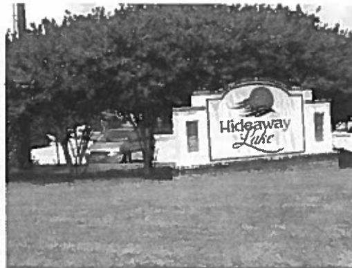
Our beautiful, safe city... only two ways to enter and one of those closes at midnight