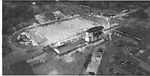
Josiah's school and football "ain't" no joke in East Texas