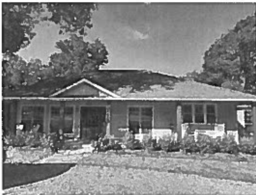
The Lord provided a beautiful home

Our address is 534 Dogwood Lane, Hideaway TX 75771. Here are some more pictures of "home".